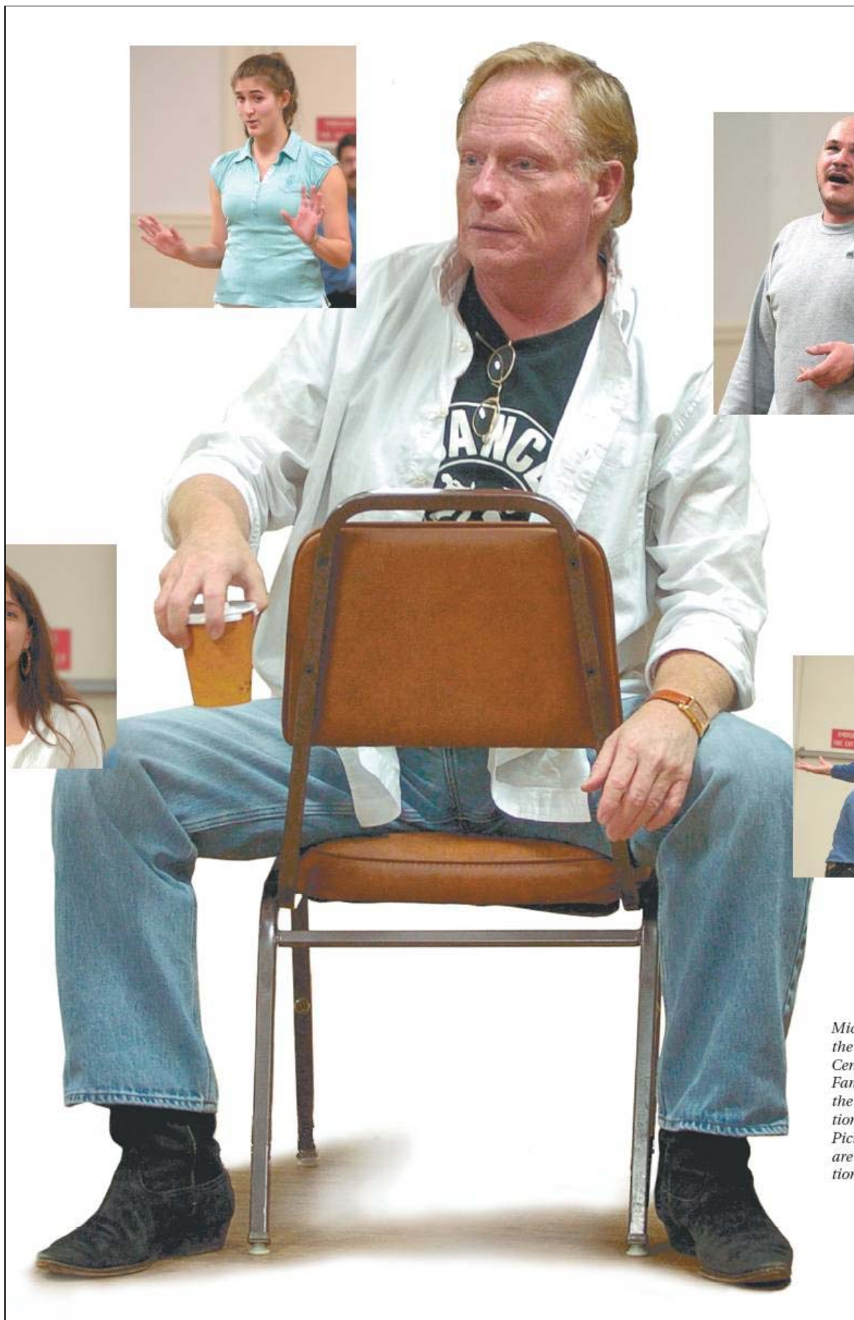
Mich the Cen Fan the tion Pic are tion